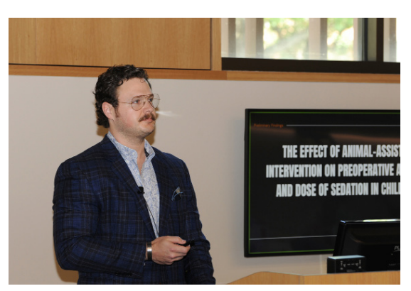
Graduate students present their research presentations at Phi Zeta Research Day.