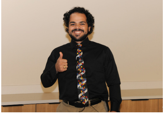
Students and faculty participate in Phi Zeta Research Day activities.